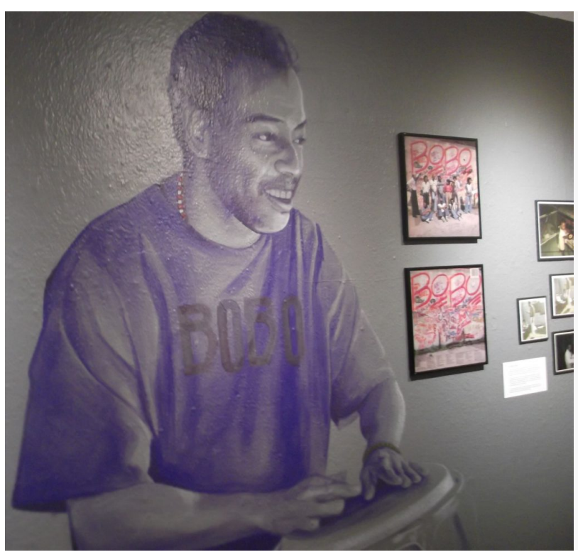
Willie Bobo wall display

A large, diverse, exuberant crowd assembled inside the William Grant Still Arts Center, Saturday, March 7, 2020. The threat of rain couldn't dampen their resolve to attend this important event.